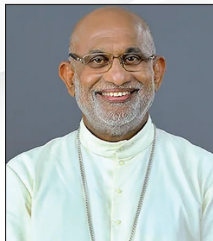
His Beatitude Mar Raphael Thattil